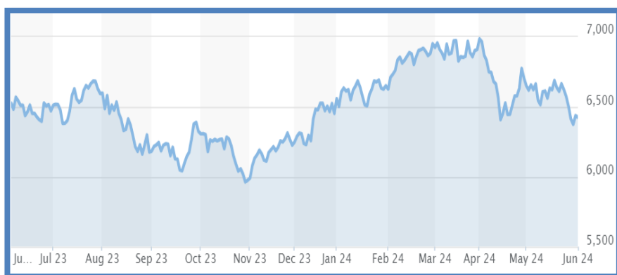
Philippine Stock Exchange Index (PSEi) 1-year chart

After hitting all time highs, global markets are ripe for a correction or consolidation. While this may also cause the PSEi to take a breather, stocks are very close to support levels and have very undemanding valuations.